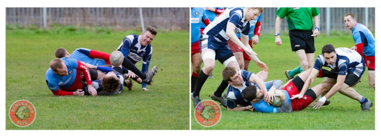
Match report by Eddie 'Billbob' Murphy Pictures by Peter Haigh (for the full set of pictures see <u>Peter's Flickr Page</u>)