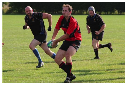
Post-match post protector