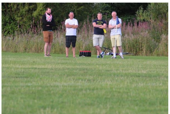
Beaky reveals all (well quite a lot anyway)